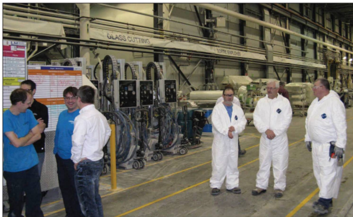
Between July 2016 and the beginning of 2018, the LM employees will have seen 265 new colleagues join them.

The Quebec energy policy doesn't plan to order new wind energy projects before Hydro-Québec's surplus has